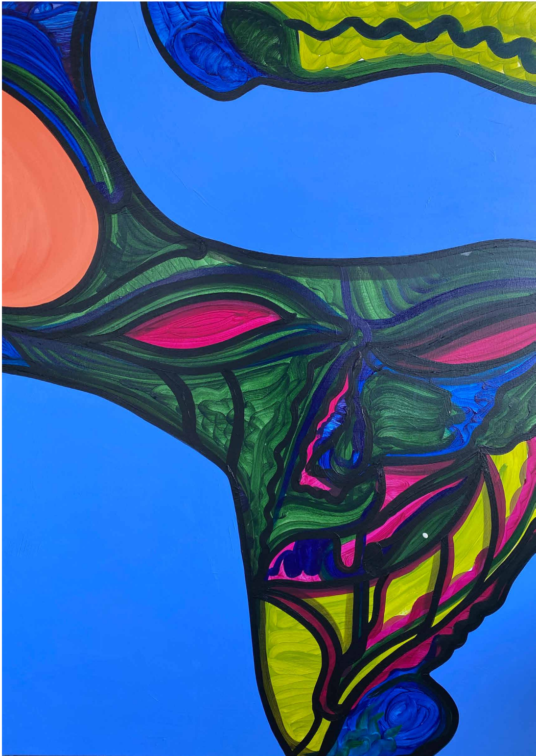
Hidden Grinch, Acrylic on canvas, 48 x 36, 2022