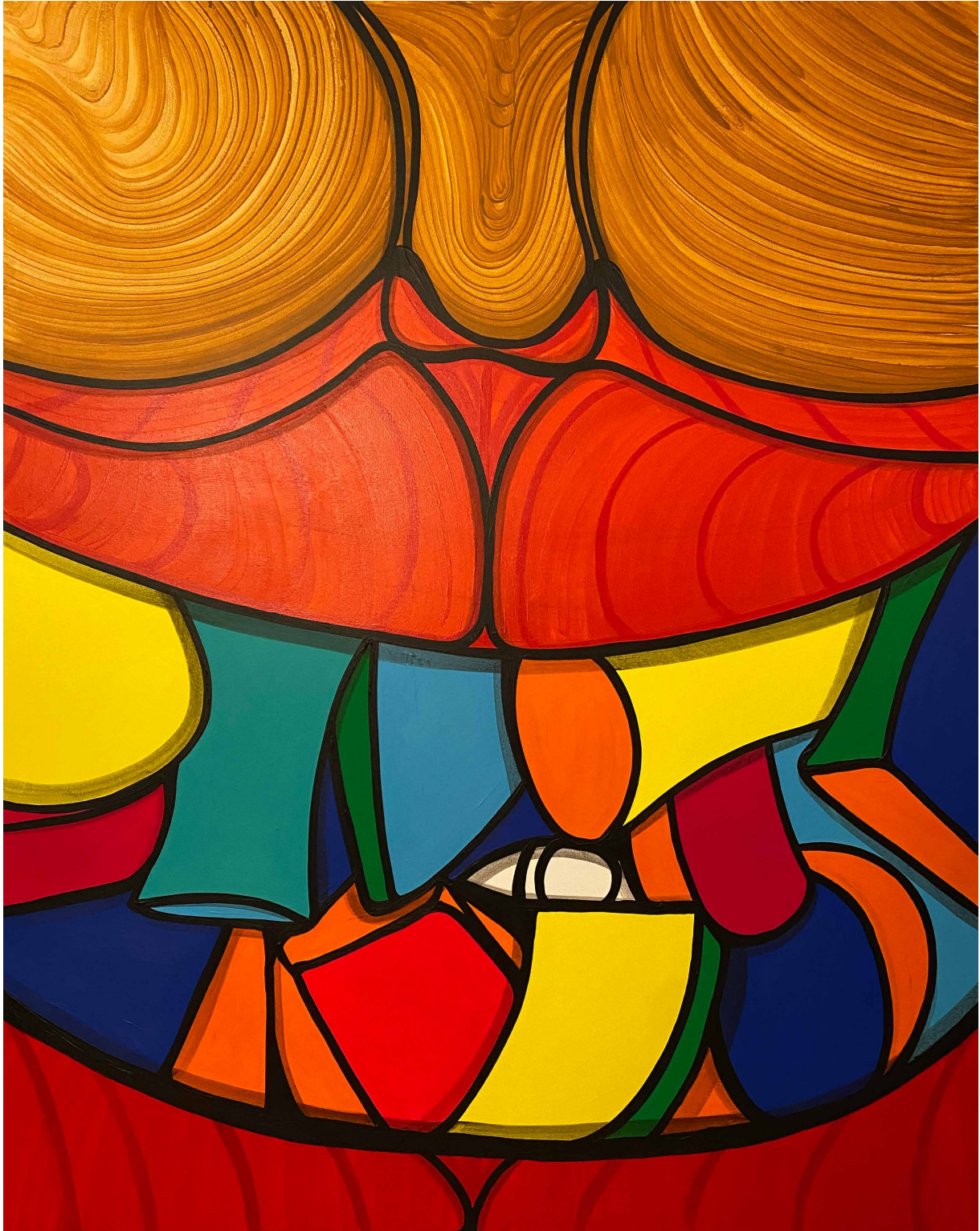
Lost in translation, Acrylic on canvas, 60 x 48, 2022