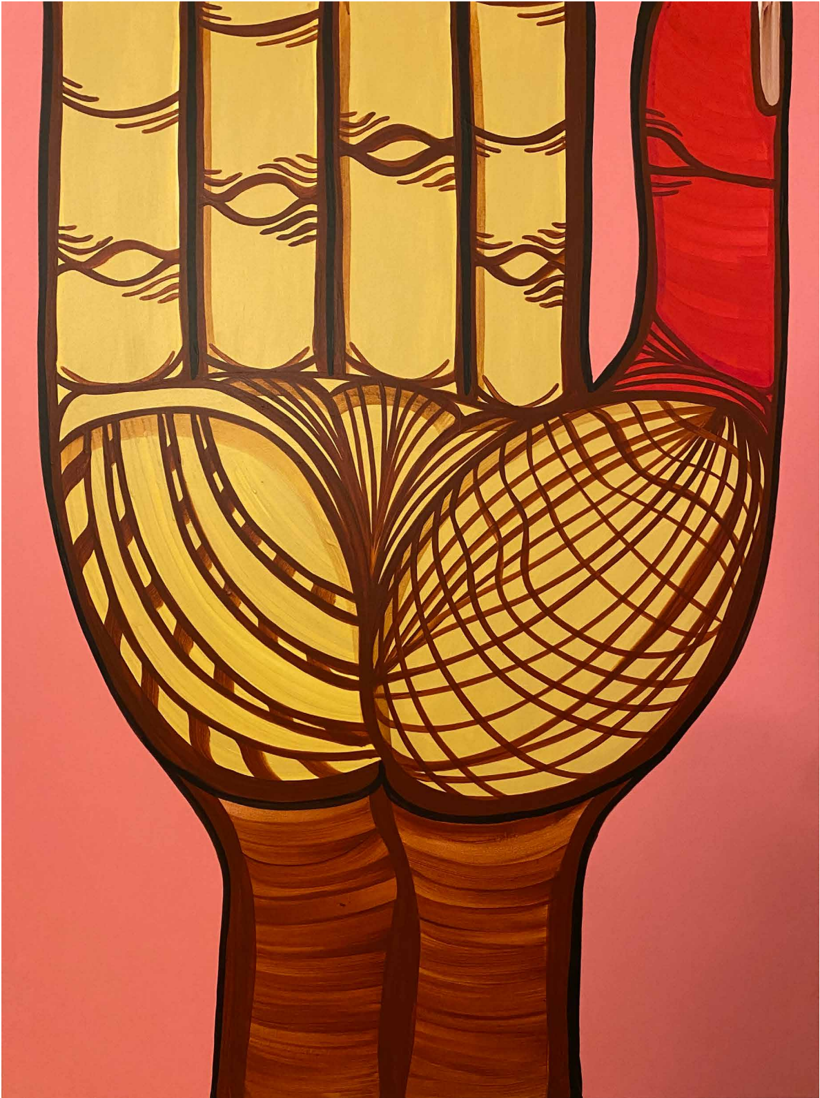
Solo, Acrylic on canvas, 48 x 36, 2021