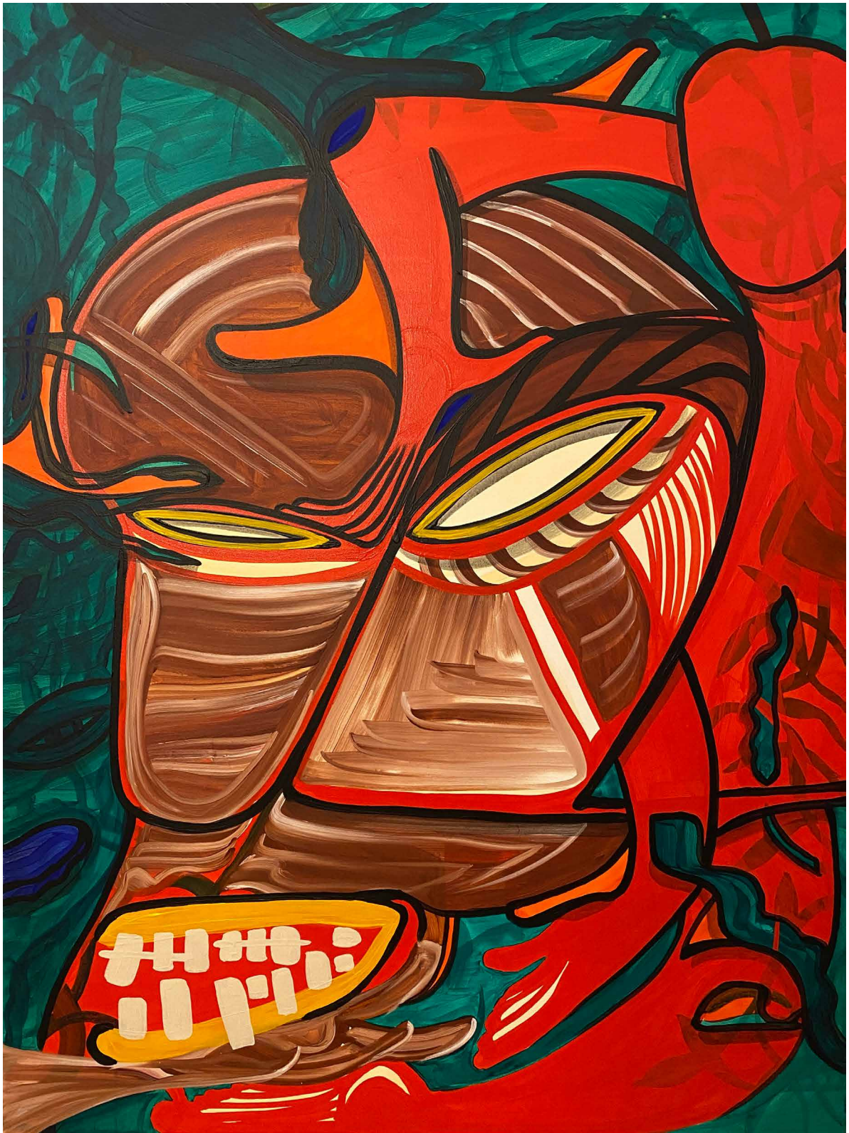
Radiant child, Acrylic on canvas, 48 x 36, 2021