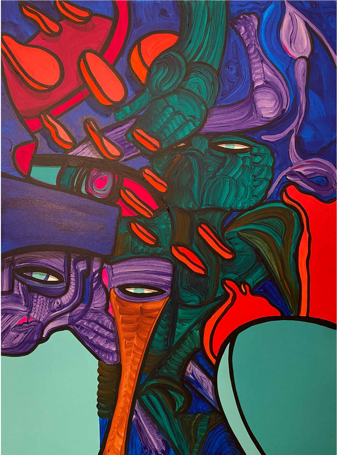
The grass is greener, Acrylic on canvas, 48 x 36, 2021