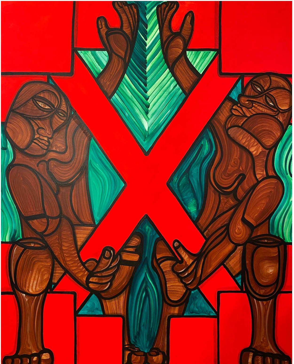
"INSERT LEGEND HERE", Acrylic on canvas, 60 x 48, 2022