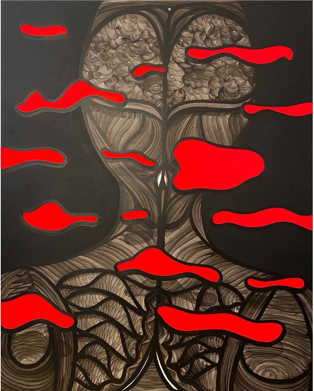
Grey matter, Acrylic on canvas, 60 x 48, 2022