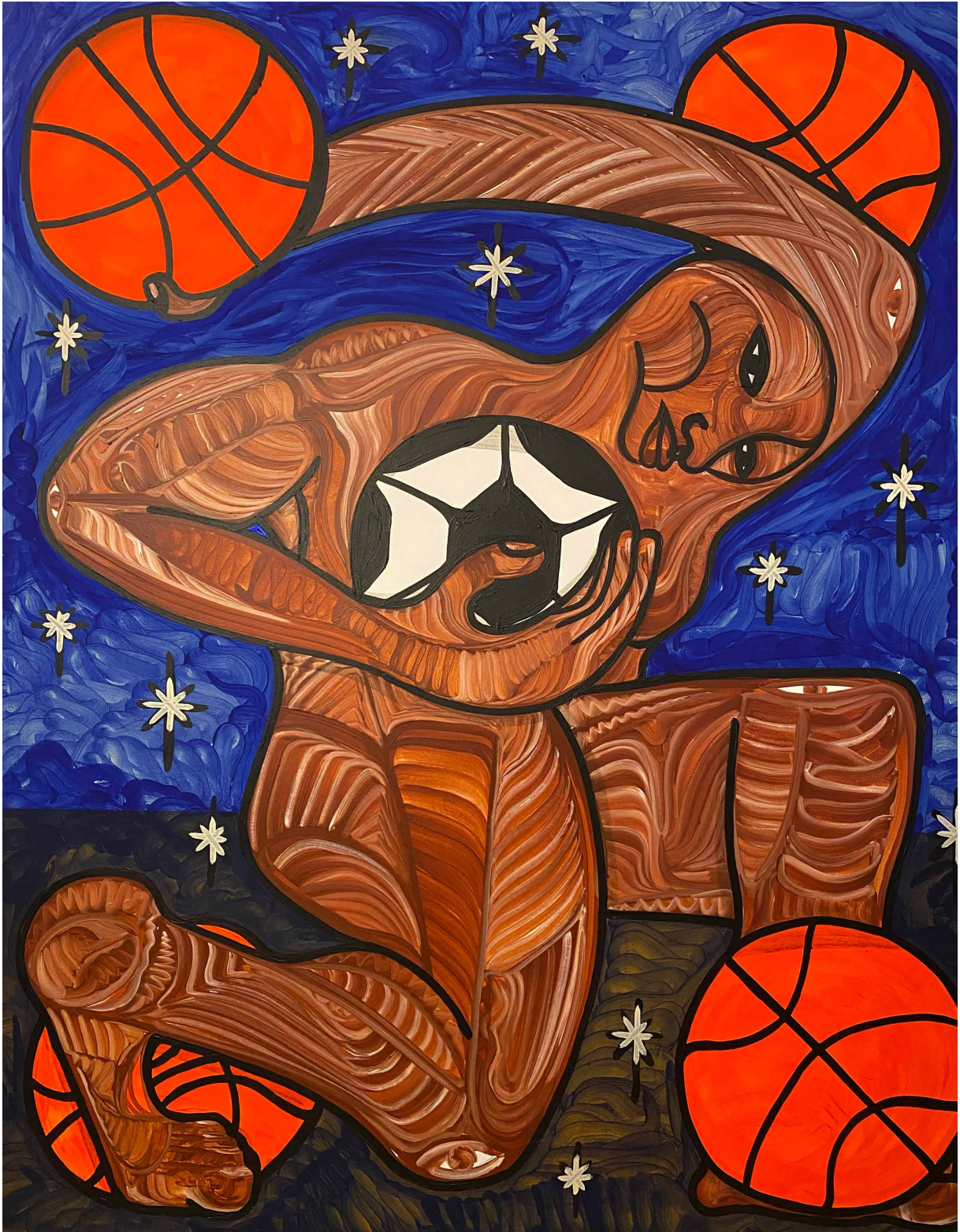
Midnight dues, Acrylic on canvas, 60 x 48, 2022