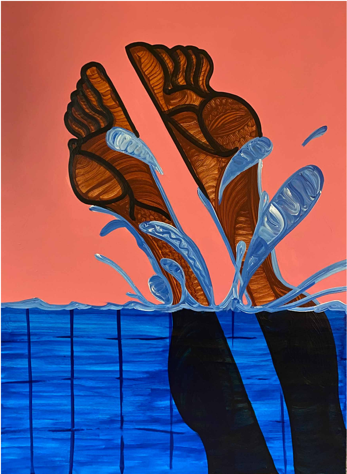
Splash, Acrylic on canvas, 48 x 36, 2021