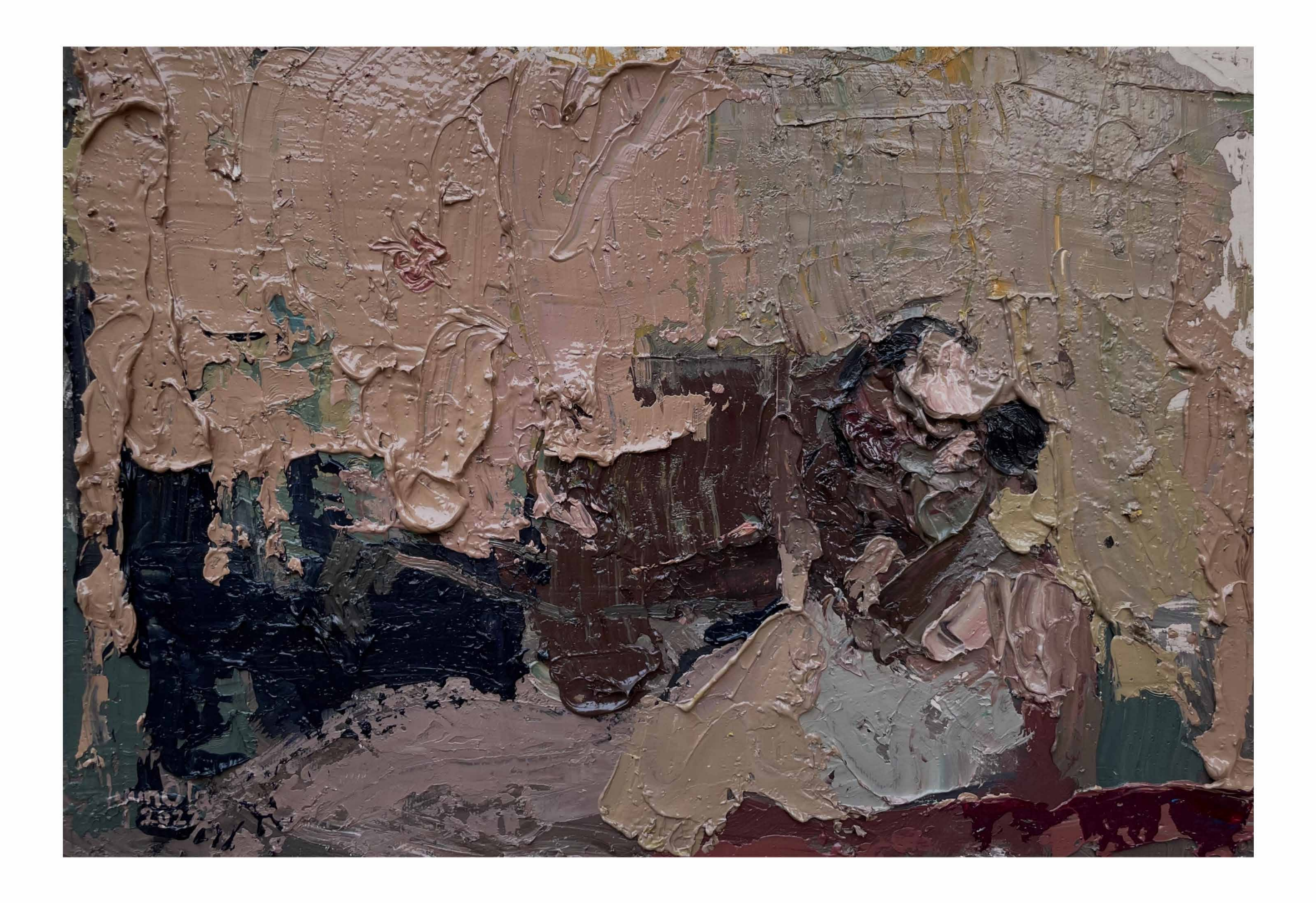
Butters fly, Oil on canvas, 11.5 \times 16 in, 2022