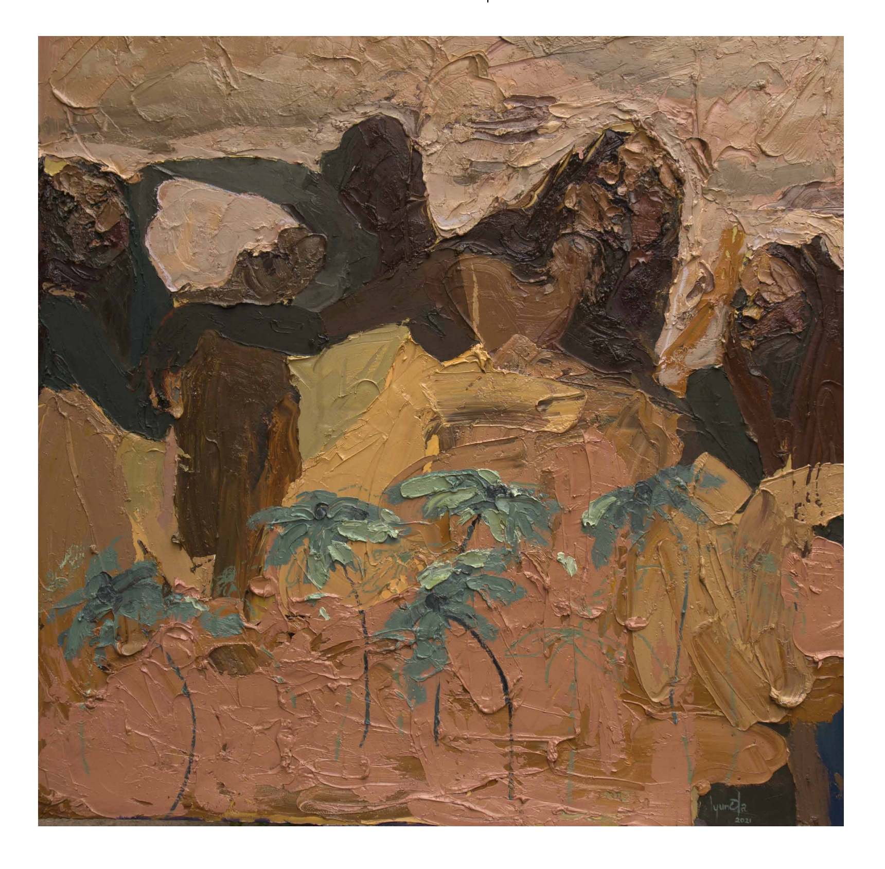
We are all but visitors to this time, Oil on canvas, 48 x 48in, 2021