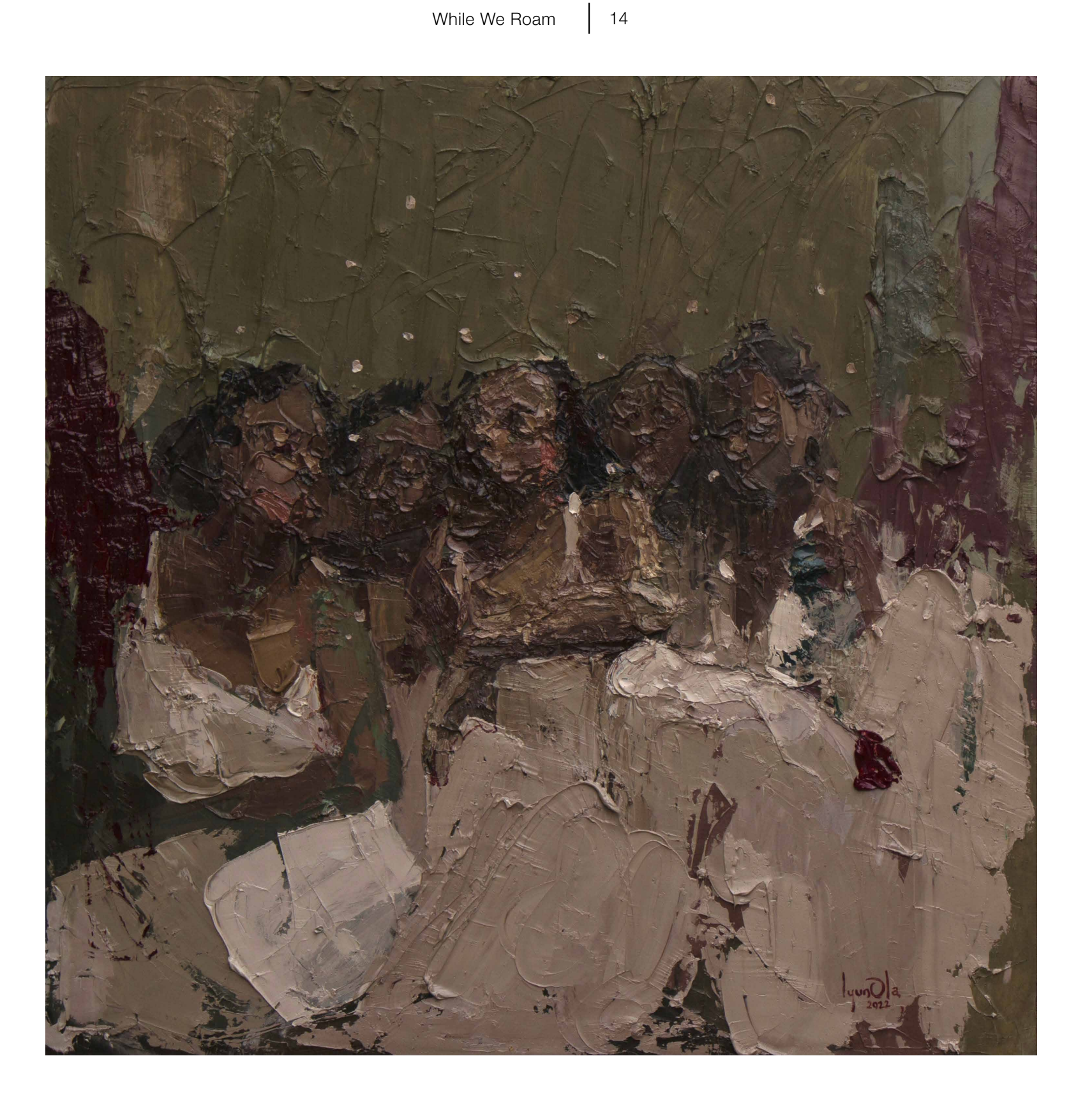
What are you leaving behind, Oil on canvas, 48 x 48in, 2022