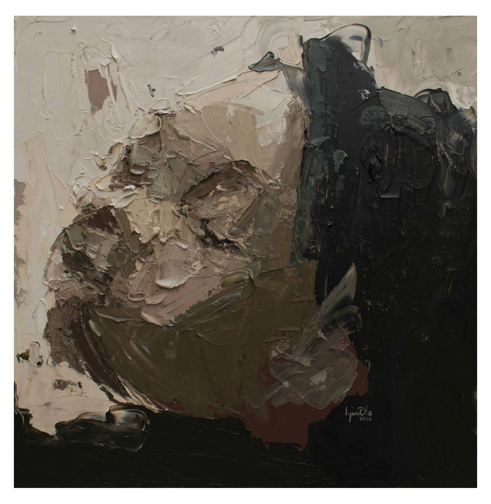
Stuck (II), Oil on canvas, 48 x 48in, 2022_