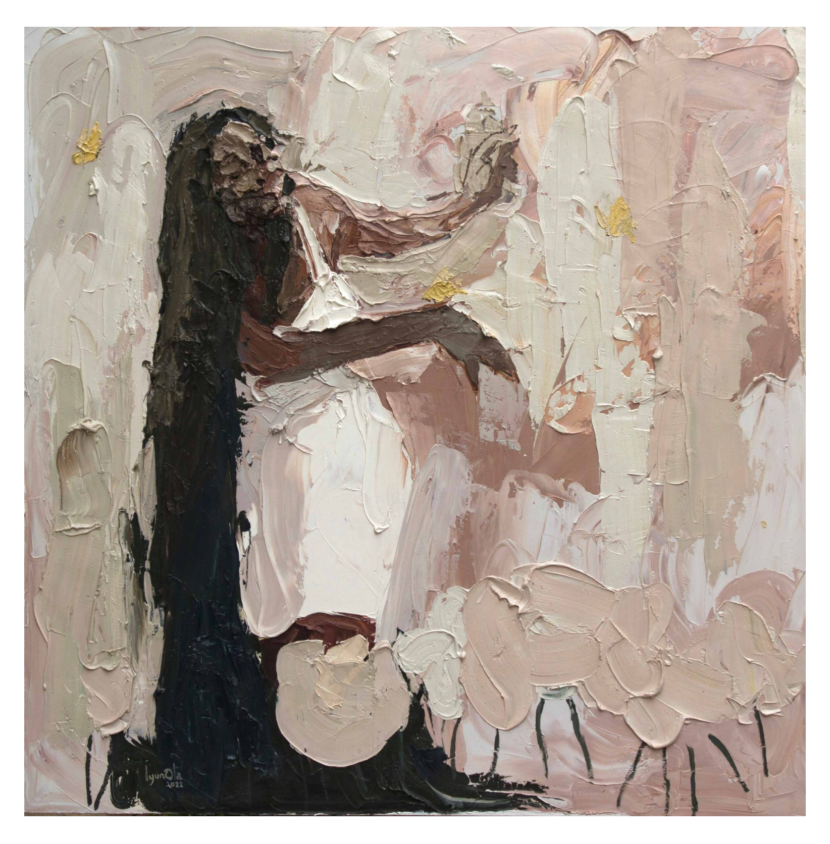
Pluck this day, Oil on canvas, 48 x 48in, 2022