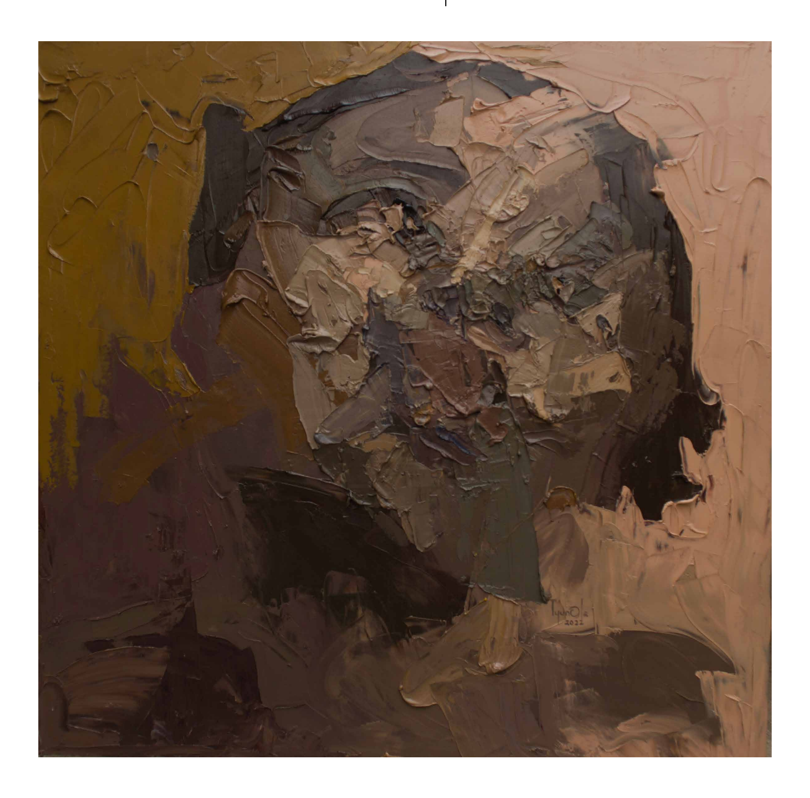
Stuck (I), Oil on canvas, 48 x 48in, 2022_