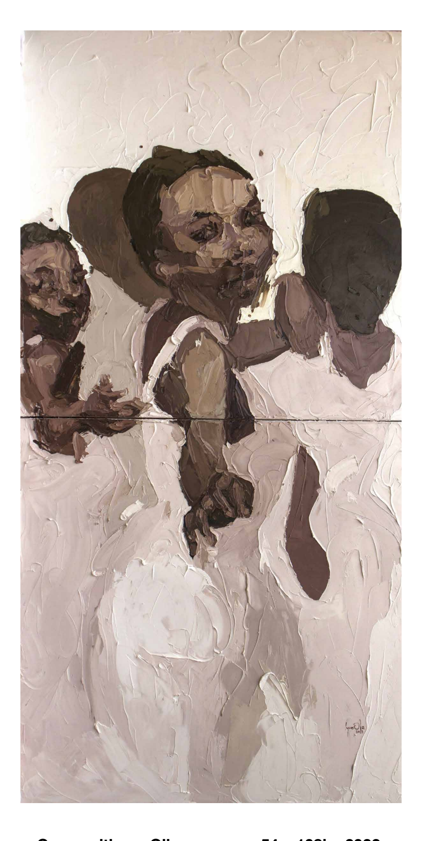
Come with us, Oil on canvas, 54 x 108in, 2022