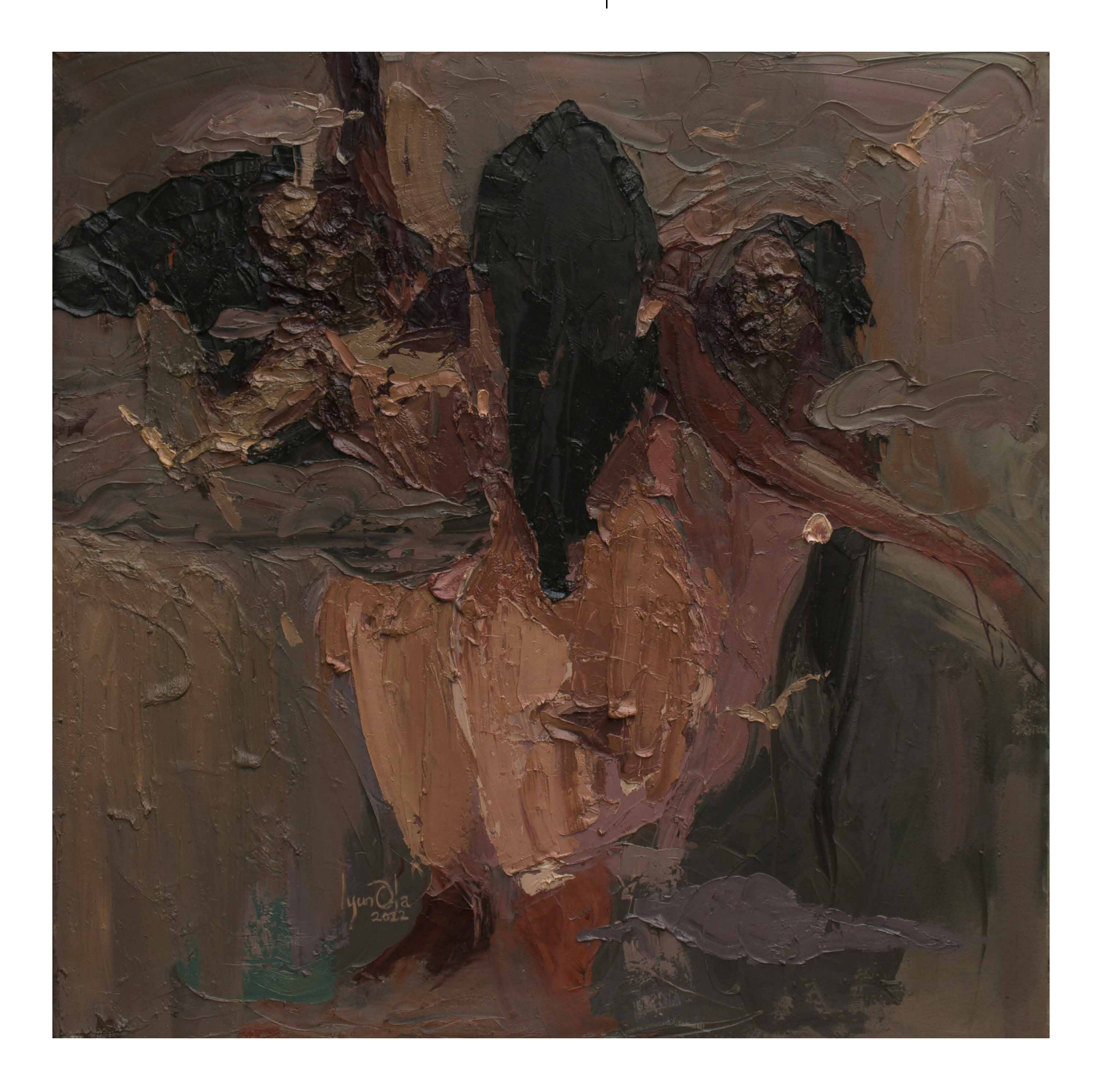
We are all but visitors to this time (II), Oil on canvas, 48 x 48in, 2022_